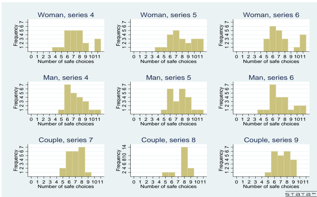
Figure 2: Empirical distributions of safe choices, couple money.

series, the distribution of couple choices is more concentrated than the distribution of spouse choices.